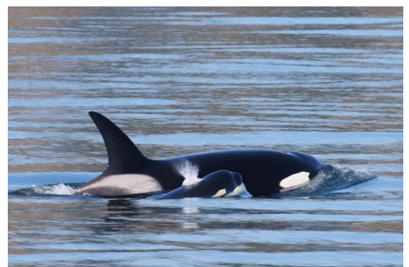
The coastal Bigg's population keeps growing, with 10 new calves born in 2022.

Another possibility could be the social component. Last year, there were huge amounts of whale watchers and boats on the water, trying to catch a glimpse of a humpback. But with a decline in watchers, they have come more freely. The whales also might be spreading the news and notifying others about the great food supply in the Salish Sea, causing the increase.