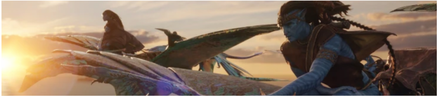
Avatar Way of Water

This past December, acclaimed filmmaker James Cameron released the long awaited sequel to his 2009 movie, Avatar. The latest addition to the franchise, Avatar: The Way of Water has grossed over 1.7 billion dollars thus far, with that number likely to increase a considerable amount. James Cameron has plans for at least three more movies in the Avatar series, however, the release of movies four and five were dependent on the success of The Way of Water. To the relief of Avatar fans around the world, it has been announced that the most recent addition to the franchise is profitable and the next movies will be made. The third Avatar movie is currently undergoing the editing process, and is set to release in December of 2024.