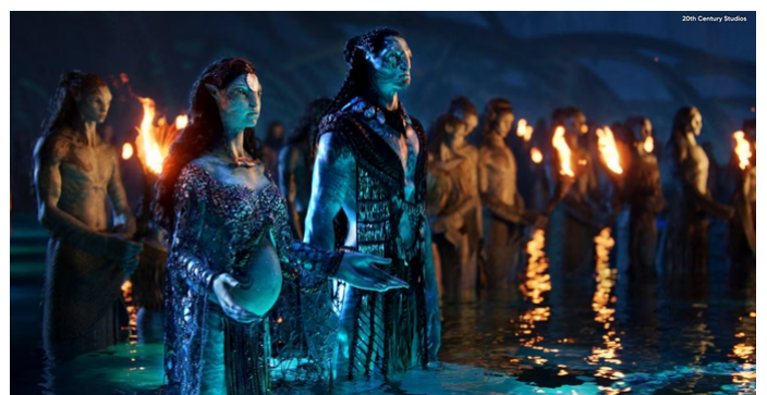
Avatar Way of Water

At present, the information disclosed regarding the next Avatar movie is that the film will explore a new fire clan on Pandora, and reveal a darker side to the Na'vi. So far in the series, humans, which are described by the Na'vi as "sky people", have been portrayed as the antagonists, as the first Avatar film dealt with the destructive impact of human activity on the natural world. The Way of Water continued to explore this theme, and "sky people" were often cast in a villainous light as violent and immoral characters. This may very well change, as the next movie is expected to demonstrate that not all humans are bad, and not all Na'vi are good.