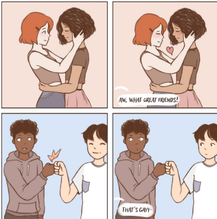
THE DOUBLE STANDARD