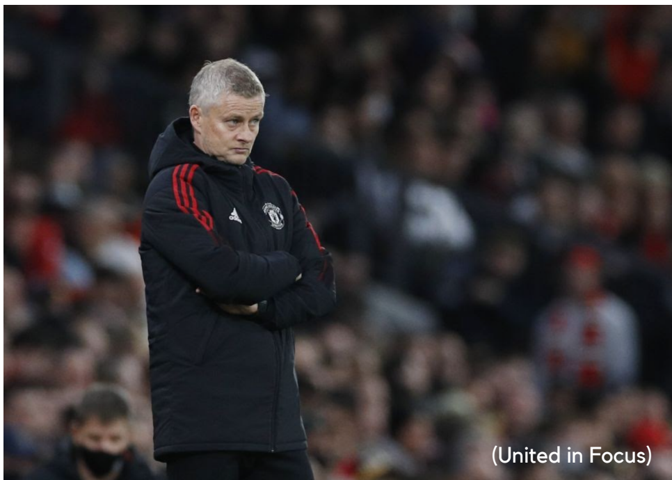
(United in Focus)